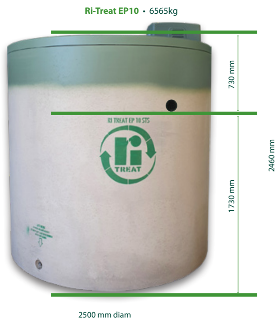
Ri-Treat EP10 • 6565kg